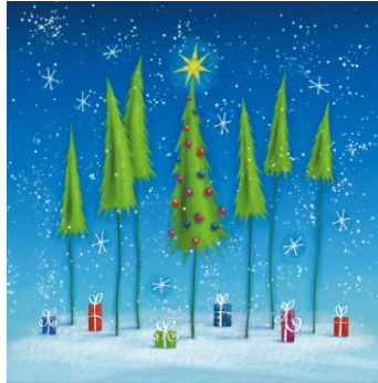
"Forest Of Presents"