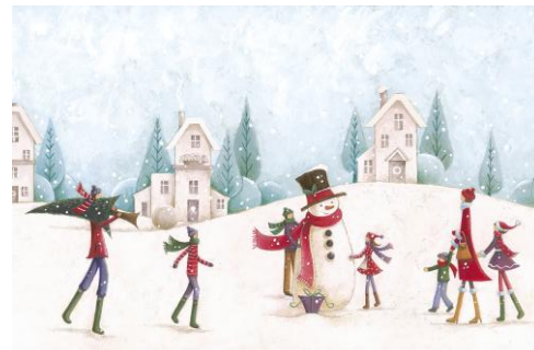
"Snowman and Friends"