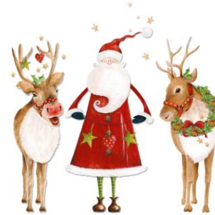
"Santa and his Reindeer"