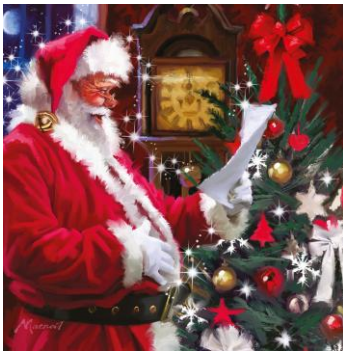
"Checking it Twice"